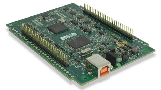
The OEM versions have the same specifications as the standard devices, but come in a board-only form factor with header connectors instead of screw terminals.

OEM versions have board-only form factors with header connectors for OEM and embedded applications (no case, CD, or USB cable included). All devices can be further customized to meet customer needs.